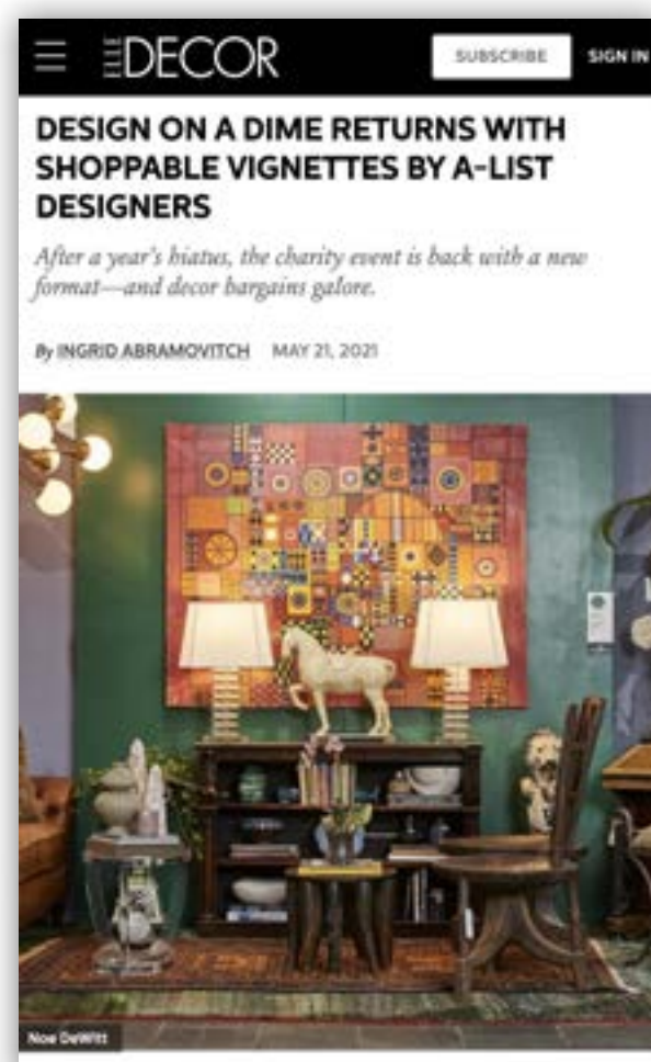
5/21/2021: Elle Decor