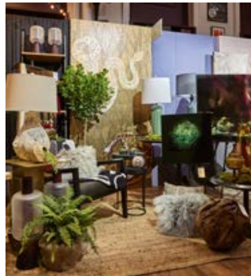
KD Reid Interiors