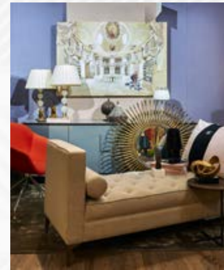
Paris K Design