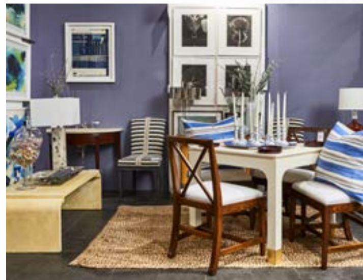
Zuni Madera for foley&cox

For full gallery of high resolution images click here or scan the QR code to the right.