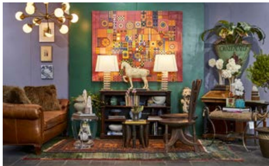
Housing Works Thrift Shops