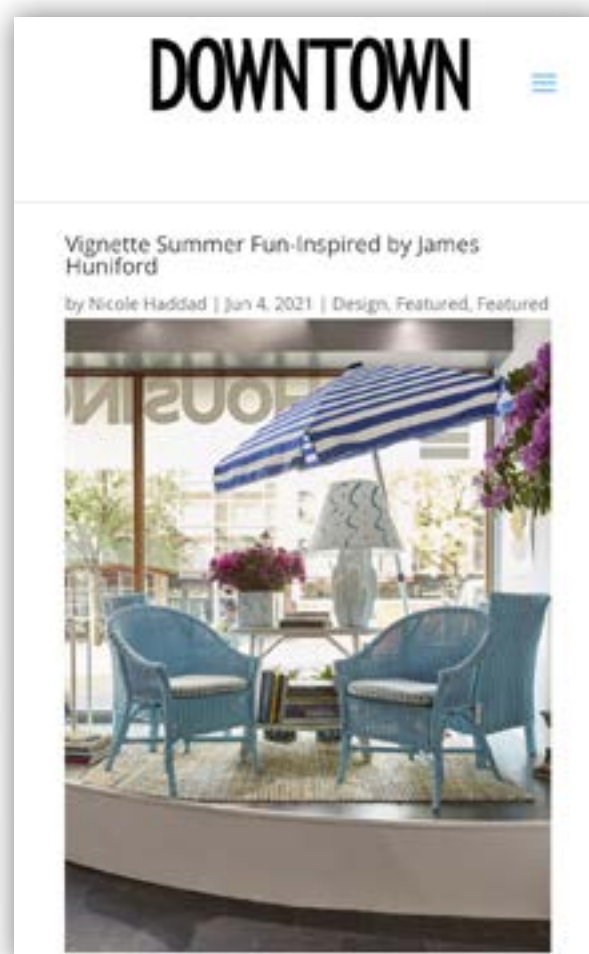
6/4/2021: Downtown Magazine