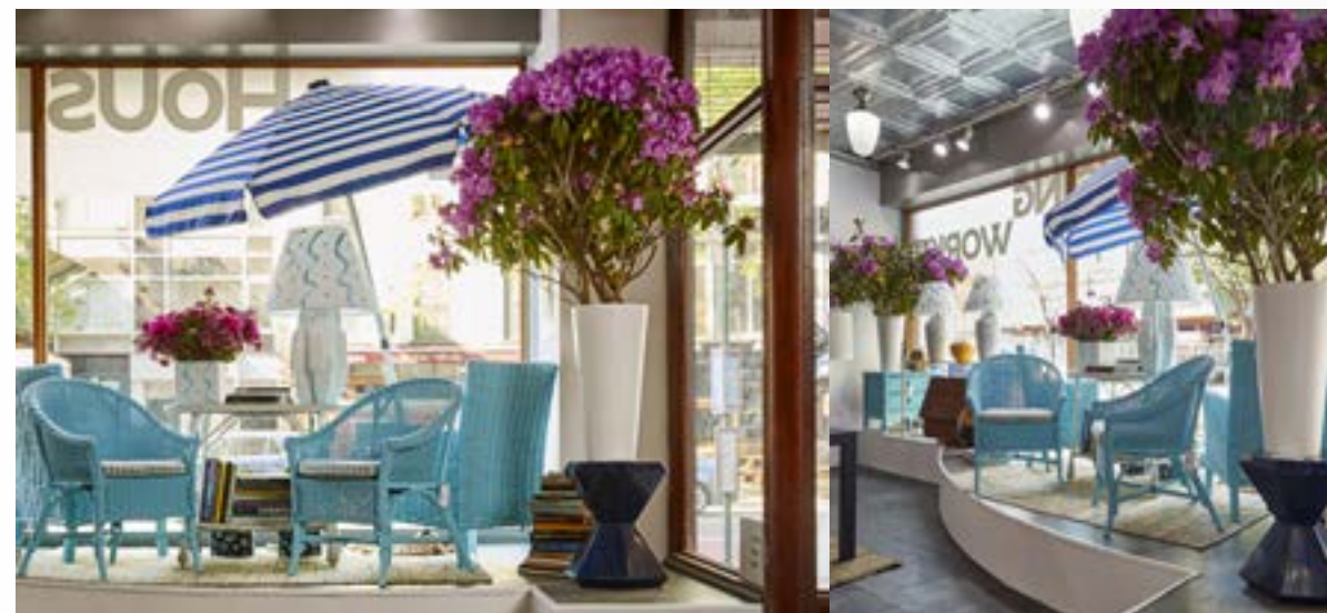
Huniford Design Studio