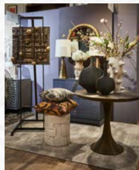
Curated by Younghye