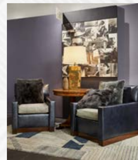
De La Torre Design