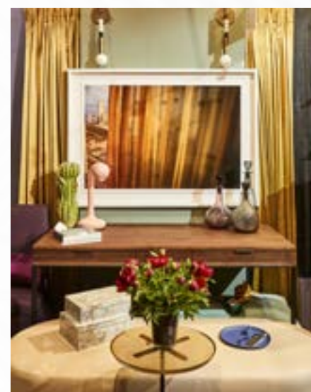
Butter and Eggs