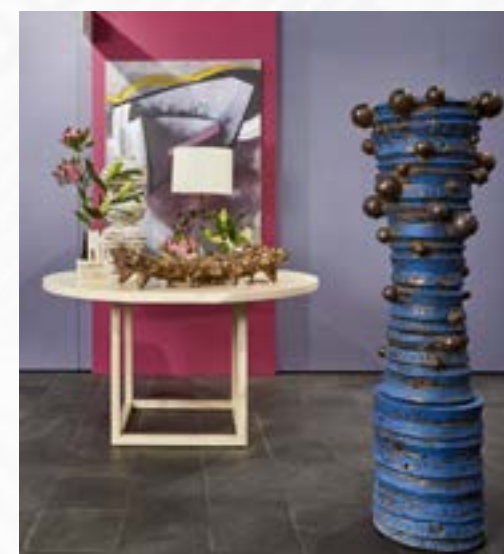
Carl Barnett Design/Studio