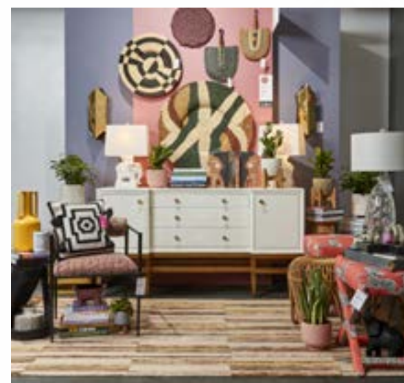
Beth Diana Smith Interior Design