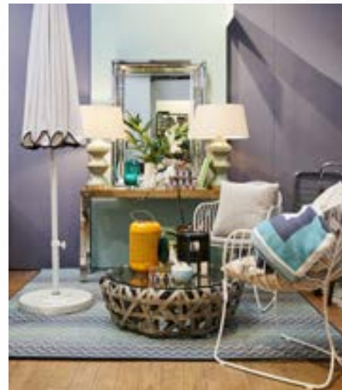
Melone Cloughen Interiors